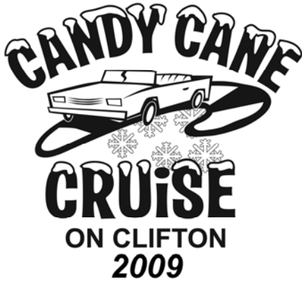
PHOTO ORDER FORM

To order additional souvenir photos from the 2009 Candy Cane Cruise on Clifton simply fill out this form and: